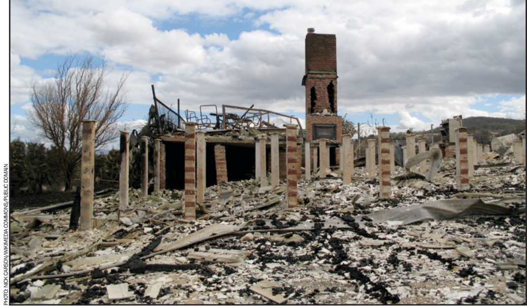
The bushfire-ravaged remains of a house in Yarra Glen

of factors—an unprecedented heatwave, 100km-plus north-easterly winds, extremely low humidity levels, faulty powerlines and an existing fire having jumped containment lines—led to the outbreak of around 400 individual fires. The intense fires raged for weeks, becoming the most devastating in Australia's history and resulting in the highest ever loss of life from bushfire. In the aftermath, 7 February became known as Black Saturday. The effect on human life was overwhelming, with 180 deaths and more than 400 people injured. In addition, hundreds of thousands of hectares were burnt, more than 3,500 buildings were destroyed and over a million domesticated and wild animals perished.