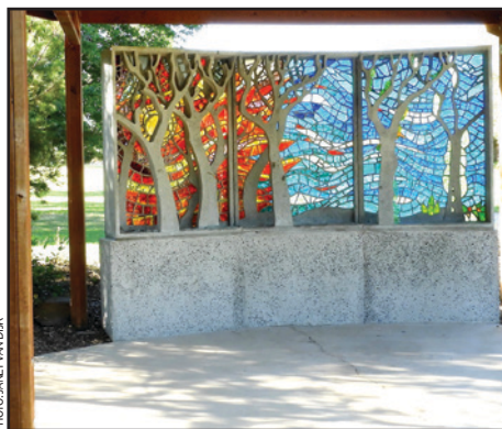
McKenzie Reserve's bushfire memorial is dedicated to Yarra Ranges residents who lost their lives on 7 February 2009 and to the heroic efforts of emergency services personnel and community members. The panels illustrate the destructive force of the fire, the rebuilding of the community, and regeneration of the land.