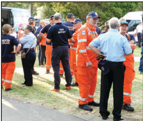
After the commemoration, people stayed to chat and enjoy coffee, ice creams, and a sausage sizzle cooked by Yarra Glen Men's Shed.

Saturday 7 February 2009 was a bleak day in Victoria's history. On that day, a combination